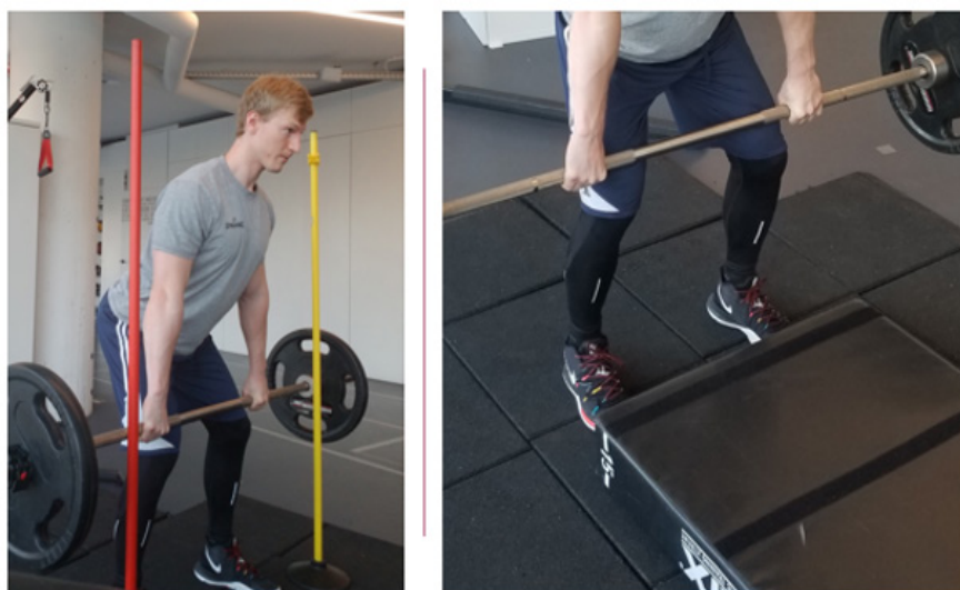
Figure 5. External objects may be used as visual cues to reduce forward barbell passage and excessive horizontal displacement.

coaches to set out problems rather than provide solutions, and design specific conditions for practice from which movement solutions emerge in each athlete respectively [36]. For instance, chalk on the barbell may be applied to show the athlete where contact was made on the thigh and allow exploration of different timings from the start of the second pull. Figure 5 displays external objects (pole rails progressing to a 15-cm mat) in front of the athlete which may be used as visual cues to reduce forward barbell passage and excessive horizontal displacement [36].