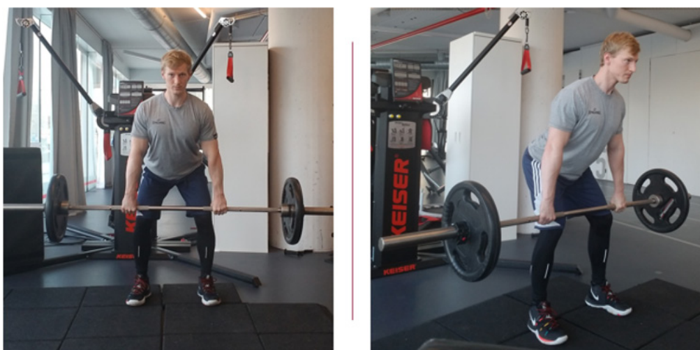
Figure 2. Set position for the hang power clean.

power position, his or her back extends and hips move forward at the same instant while the bar ascends vertically (up and into the body). To avoid friction and deceleration during this phase, the bar should remain as close as possible to the body without touching the thighs until arriving at the peak power position. Once the bar reaches midhigh level, the momentum created in the ascent should be exploited as an explosive triple extension movement as soon as reaching the peak power position reflected by aggressive extension of the hips, knees and ankles (“big jump”) while shrugging the shoulders (“bring your shoulders to your ears”) (Figure 3a). As result of this aggressive full extension, the athlete should carry forward the momentum of the bar by bringing the elbows up and out (upright row) as the bar continues to