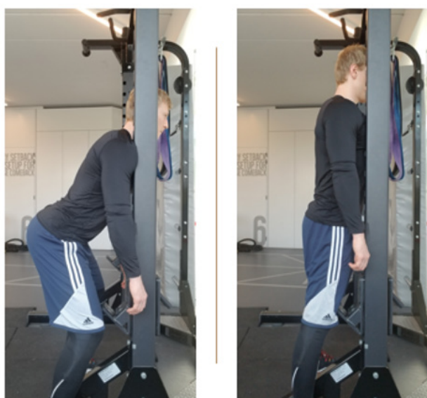
Figure 4. Squat rack corrective exercise. Teaches the athlete to bring the hips forward while keeping the shoulders over the midfoot line.

4. Teaching progressions: Traditionally, the 6-step progression model has been suggested as a method to teaching the hang power clean and consists of breaking down the movement (decomposition) in subsequent steps (whole-part-whole method) [11]. However, a ‘constraints-led approach’ (athlete-centered) to teaching complex movements (exploring complete movements in its entirety) has recently been favoured over the traditional top-down, coach-controlled approaches based upon skill acquisition theory leading to more autonomy by the athlete [36]. Through this constraints-led approach, ecological validity is optimized by adjusting the conditions to perform and refine the lifters hang clean technique, rather than verbally instructing decomposed, isolated, and inherently different skills. Practically, this approach requires