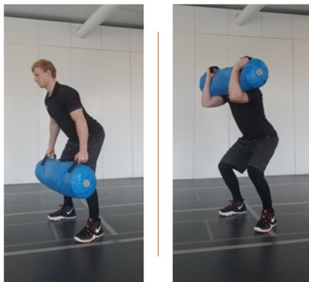
Figure 6. Sandbag hang clean variation.

stress on the lower back, allowing for a more upright set position, which may promote more optimal execution of triple extension in a loaded squat jump [24]. While unstable variations such as sandbags or waterbags, offer perturbative forces that require continuous body stabilization, especially at high velocities. Calatayud et al., [7] reported greater muscle activation of the core when during the waterbag clean in comparison to the traditional barbell version.