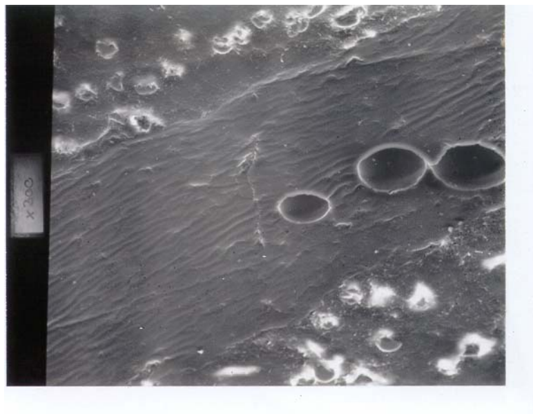
Figure 11: 300 Times Microscopy Photo of Diffusion of Araldite into Thermoplastic Composite