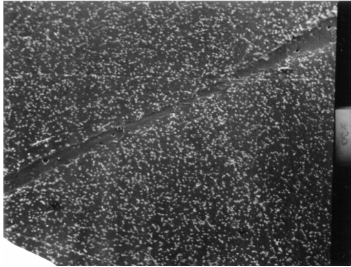
Figure 10: 30 Times Microscopy Photo of Diffusion of Araldite into Thermoplastic Composite