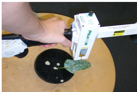
Figure 1: The laser scanner, from [5].

Application of the laser scanner for plant digitising raises several issues. One is that the surface may not produce sufficient laser contrast for the scanner to detect a profile. This may be caused by shininess or by the colour of a surface. Since a green surface will absorb light of any colour but green and laser light is relatively pure in colour, not enough of a red laser beam may be reflected from the object and received by the scanner cameras to calculate positions of the data points. Rather than an expensive change from a red to a green laser, the surface may be treated to change its reflective properties. Using an airbrush, very fine chalk or clay dust can be mixed with water and then sprayed onto the surface, which is subsequently left to dry. This technique has been successfully applied to leaf surfaces in [5], see Figures 1 and 2. The added thin layer allows the user to capture data on plant surfaces using a red laser scanner.