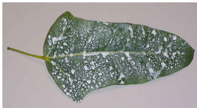
Figure 2: A treated leaf surface, from [5].

Another issue for performance of the laser scanner is magnetic interference. All metallic objects and electromagnetic fields need to be removed from within a certain distance from the transmitter, since they interfere with the magnetic field generated to identify the position and the orientation of the wand. Failure to do so will result in faulty data. We observed that even a watch worn by the scanner operator may adversely affect the quality of the resulting data.