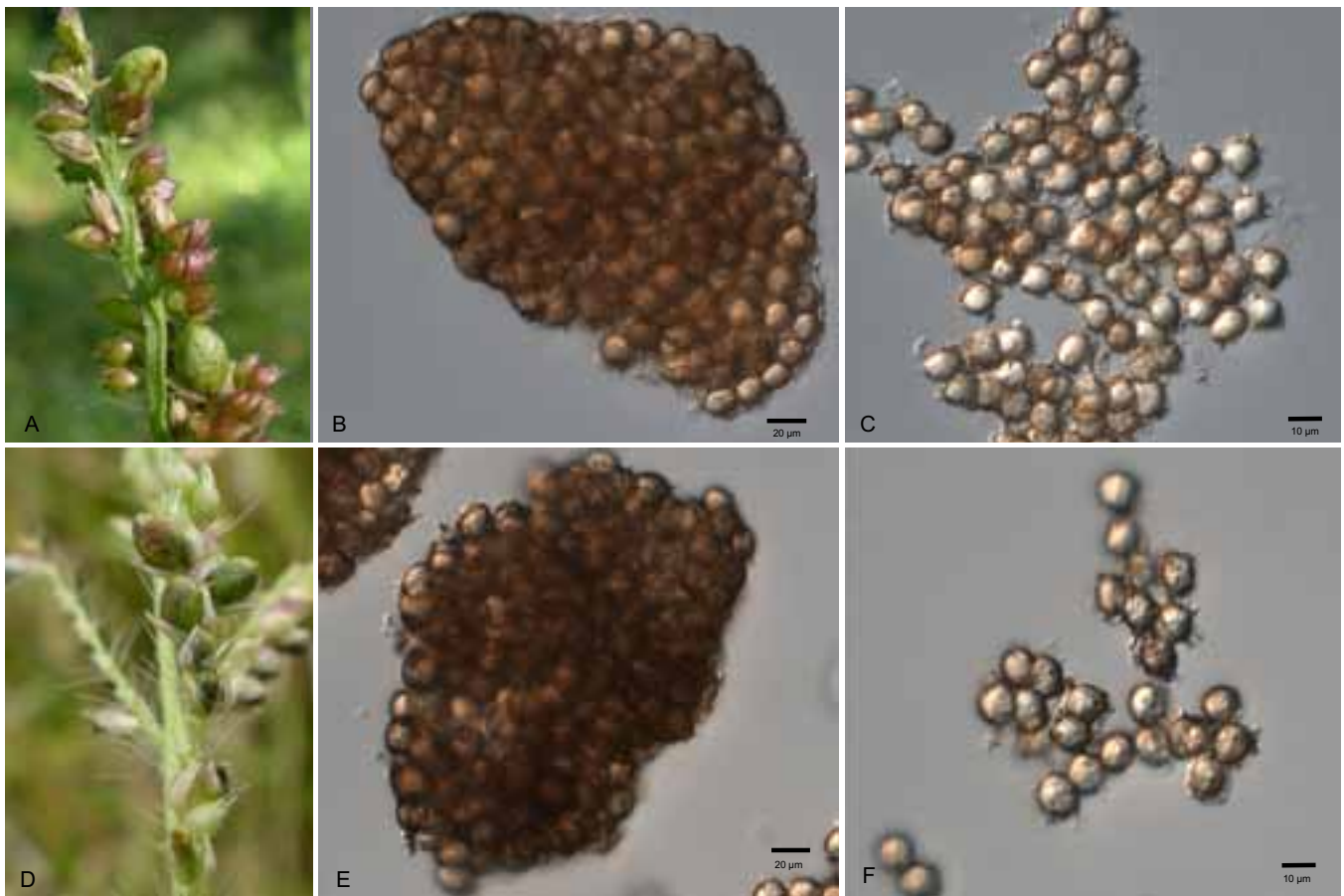
Fig. 2. Sori and spores of Moesziomyces bullatus on Echinochloa crus-galli . A, D. Sori. B, E. Teliospore balls. C, F. Teliospores. A–C (GLM-F105812), D–F (GLM-F105814).

of a larger cluster, which is interpreted here as representing M. bullatus . It is noteworthy that three of the four subclusters of M. bullatus contain environmental samples from various sources. In conjunction with the ease of cultivation observed for M. bullatus from E. crus-galli , it is concluded that unlike the vast majority of genera of Ustilaginales , the asexual yeast morph plays a major role as a proliferating life-cycle stage in Moesziomyces and that the plant-parasitic dikaryophase is probably mainly important for maintaining the possibility of sexual recombination. As the two subclades previously referred to as M. aphidis and M. rugulosus are interspersed with the morphologically identical lineages of M. bullatus from E. crus-galli , they are probably better included in M. bullatus until more sequence data become available. It seems probable that, with the inclusion of additional smut samples from Echinochloa , additional smut-causing members of the subclades will be discovered. Sampling in Africa seems to be promising in this respect, as the species diversity of Echinochloa is highest on this continent. Also, the notion that yeasts of the subclade containing the ex-type culture of Pseudozyma aphidis can withstand high temperatures, such as the human body temperature, is suggestive of a subtropical to tropical origin of this lineage.