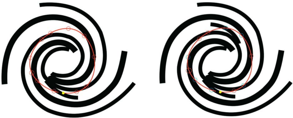
Fig. 2. The Milky Way model (left), based on Churchwell et al. (2009) and our new weighted symmetrical model (right) of the Galaxy with the Sun’s orbital path over 500 Myr. The Sun’s current position is indicated with a yellow dot. Eleven extinction events are shown along the path by circles. The six blue circles in the new Galaxy model represent the known mass extinctions as marked in Fig. 3, whilst the orange circles represent the five additional events we propose here. The thickness of two major arms is set to 1.5 kpc and minor arms (as well as spurs) to 1 kpc.

Historically, it has been assumed that the Sun’s crossing of the Galaxy’s spiral arms is a relatively simple, periodic event. However, the new model of our Galaxy’s structure (Figs. 1 and 2) reveals the truth to be significantly more complicated. The spiral arms are not evenly spaced, and a number of smaller sub-arms are dotted between them. The result is that encounters between the Sun and the spiral arms will be both more frequent and more randomly distributed in time. By using this new model of galactic structure, we are able to take account of this irregular behaviour for the very first time, enabling us to carry out the first fair study of the influence of the Galaxy’s structure on the impact flux at Earth.