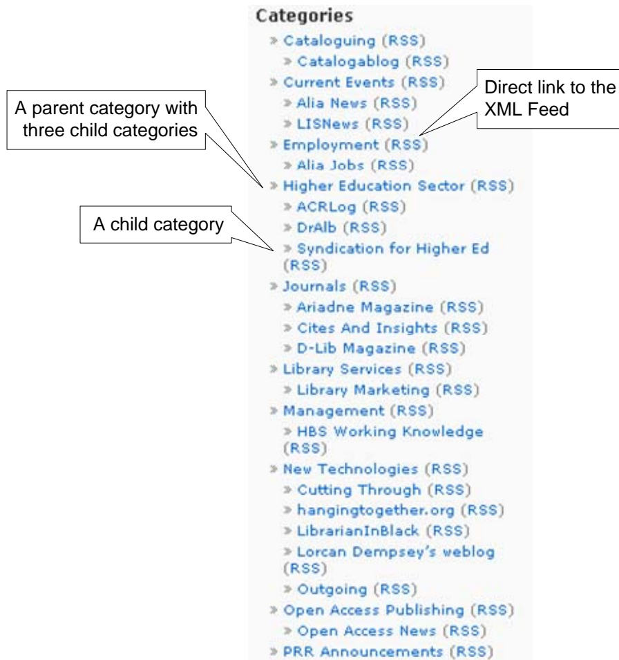
Figure 3: A screen capture of how the categories are displayed to the user.